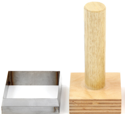
Extrusion dolly and sample cutter